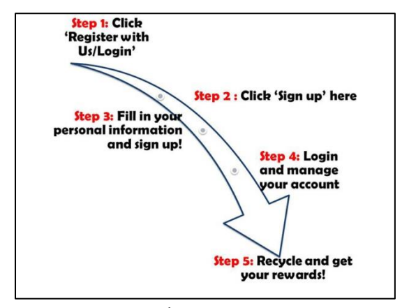
Figure 2: iCycle System Registration

The iCycle blue bin system launched by the Prime Minister of Malaysia in March 2017 commenced a good move when MMU used it as an Initial Scheme at the university and started collecting good electronic waste around the MMU campus. The iCycle system is a system platform for people to get the claim reward in iCycle by sending e-waste to the bin located in selected areas and then it can be disposed of properly. Figure 2 and 3 describe how the iCycle system works.