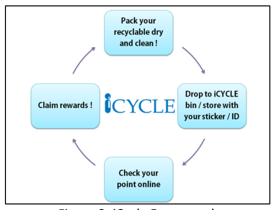
Figure 3: iCycle Framework