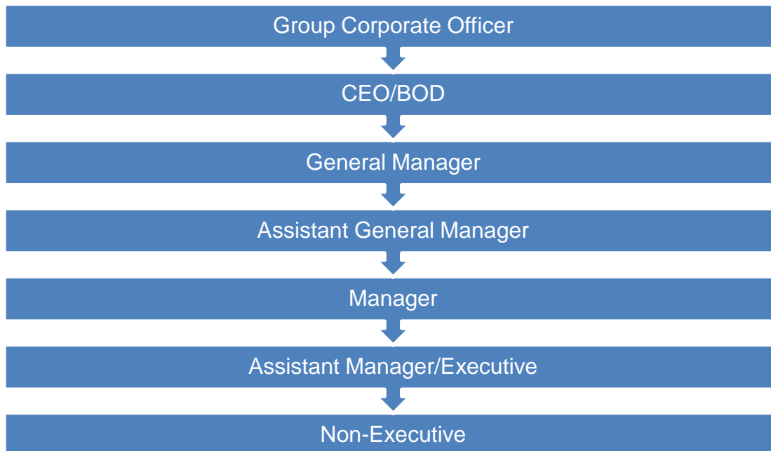
Diagram 1 The organisational structure of MMG

The BSC used is followed the organisational structure. BSC is aligned and cascaded based organisational structure. Most of the interviewees said that BSC is top down but some of them argue that BSC start with down-top and then top down and some of them said depends on the situation.