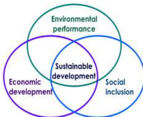
Figure 1: Model of sustainable development from conventional perspective